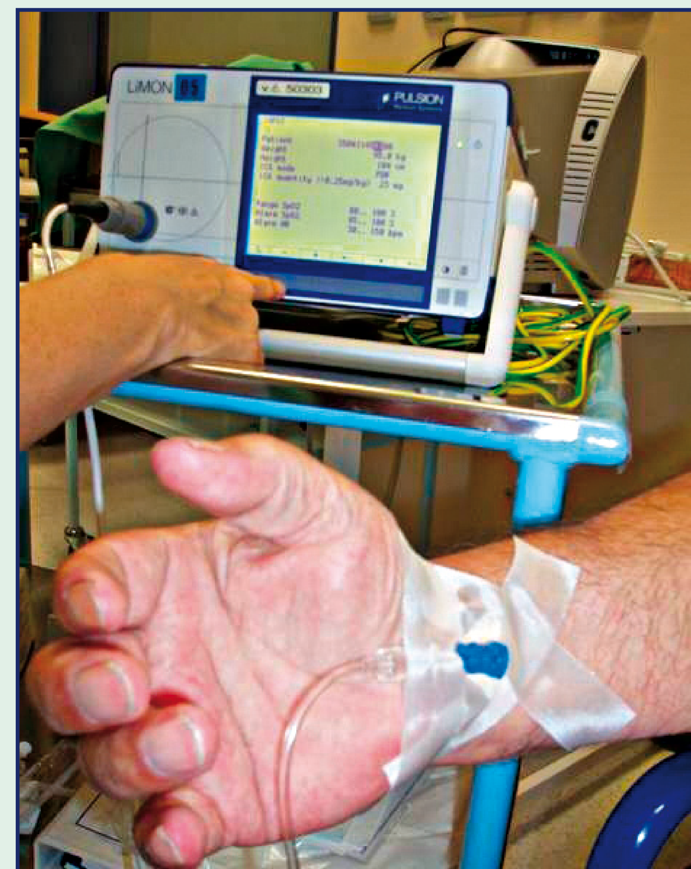
P.3: LIMON apparatus for ICG-PDR examination