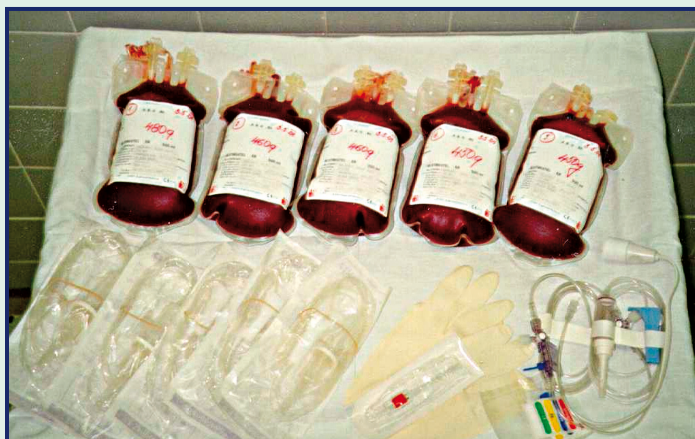
P.1: Acute normovolemic hemodilution is one of standard methods of bloodless medicine

Induced hypotension in spinal surgery is – in spite of various objections (1) – one of the methods, which save the patient's blood. All authors agree that the MAP borderline should not be lower than 60 torr. Only one work, however, is concerned with splanchnic perfusion during controlled hypotension (2). Acute normovolemic hemodilution is one of standard methods of bloodless medicine.